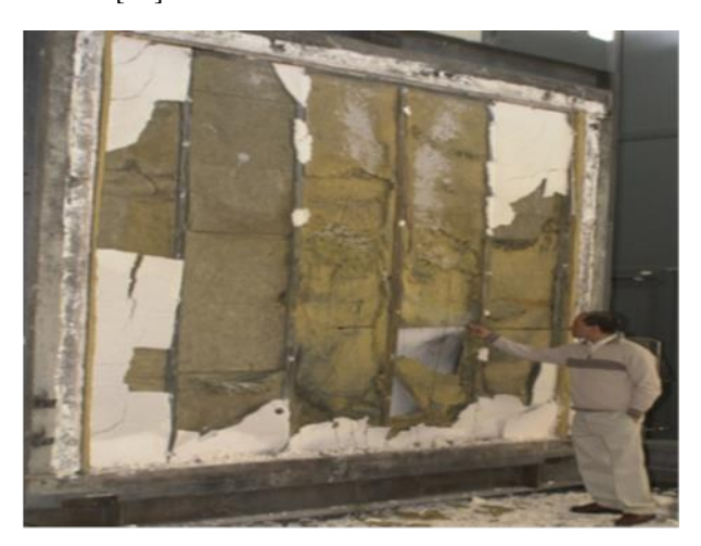
b) Post fire inspection of test wall